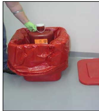
Line biohazardous waste tubs with a red liner.