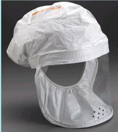
Regular – MH09601