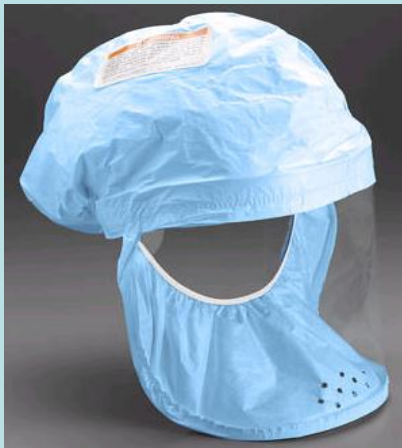
Large – MH09442